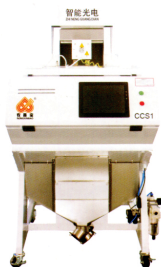
Color Selecting Machine