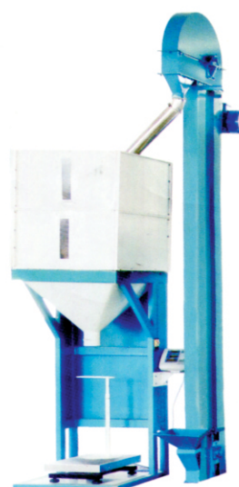
Packing Machine Model No.: T10-50kg