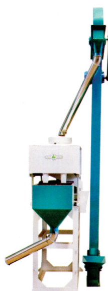
Grade Selecting Machine