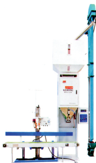
Packing Machine Model No.: DC5-50A