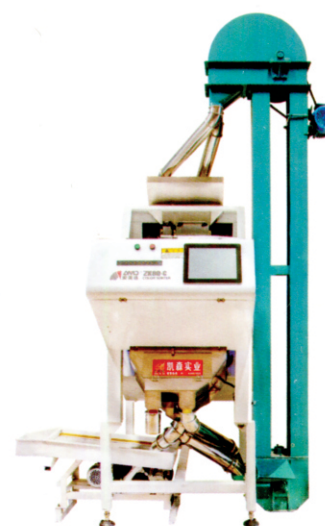
Color Selecting Machine Model No.: ZK80